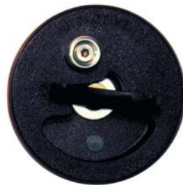
Flush-Mount Plastic Caps in either Red or Black colors

The performance advantage of the Wisco Flush-Mount Fuel Cap system is due to a specially designed plastic cap that fits inside the mating filler neck and provides a flush surface at the neck flange. Wisco Flush-Mount Fuel Caps come in an attractive finish of Red or Black.